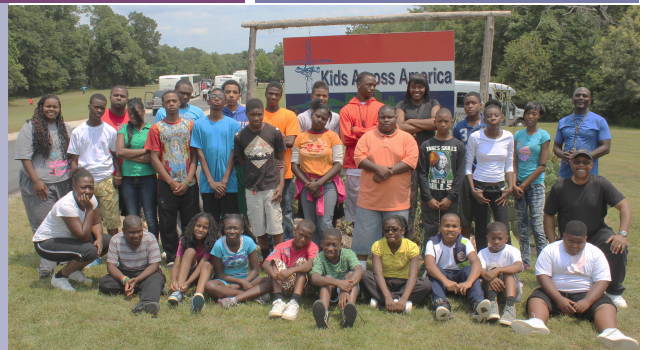
CCC/UCMs return to KAA