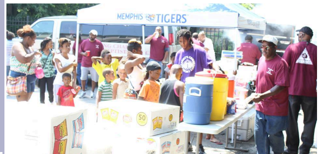
Men from Morning Chapel MBC help with Back to School Rally (front page story)