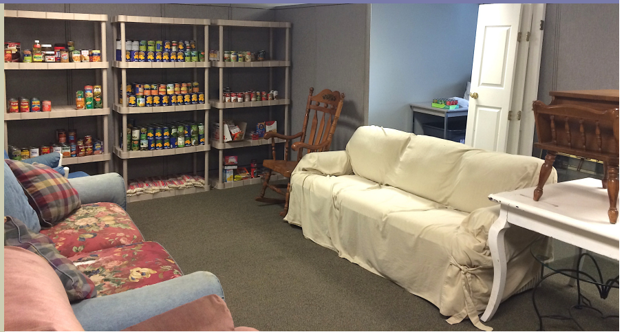
UCM's Community Closet food and furniture area (top picture) clothing room (below)